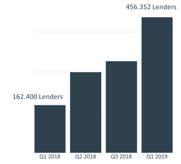
Figure 2. Number of P2P lenders during January 2018-April 2019. Source: [36].

aged between 19-34 years old. In June 2019, the total investment is recorded at Rp44.806.000.000 with 70 per cent of the investors and borrowers are youth (19-34) [36].